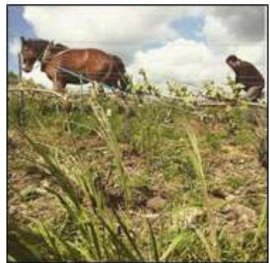
Champagne Laherte Freres organically farmed vineyards